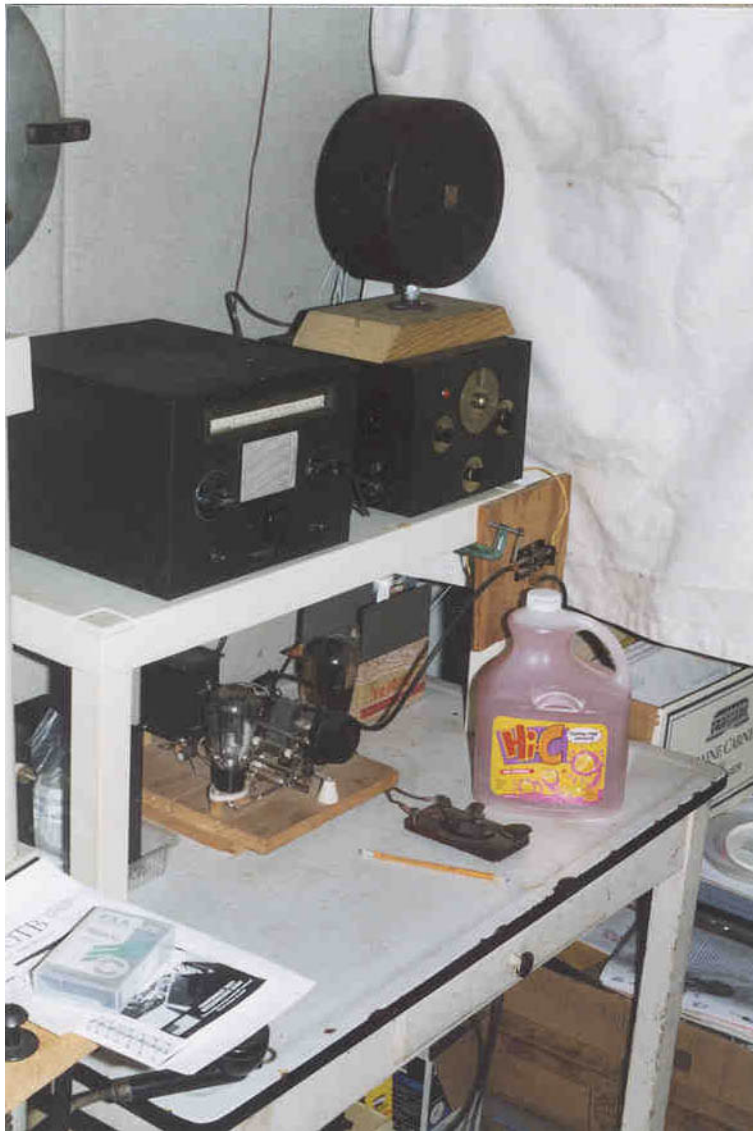
Photo of Vintage Gear. Don't ask what the bug juice is for.